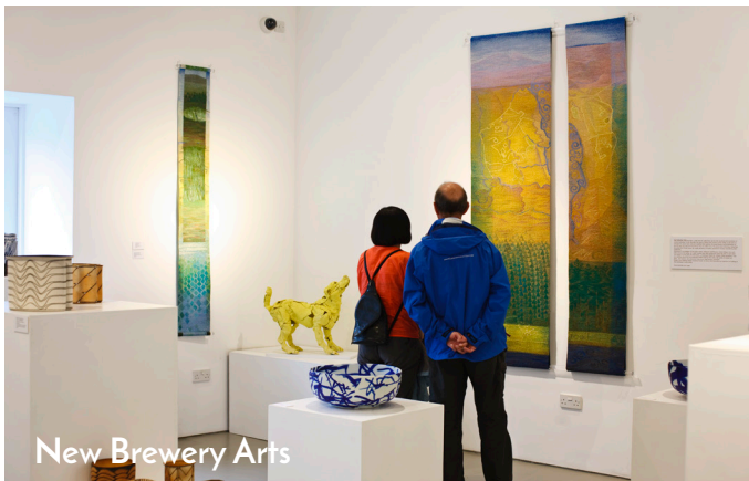
New Brewery Arts